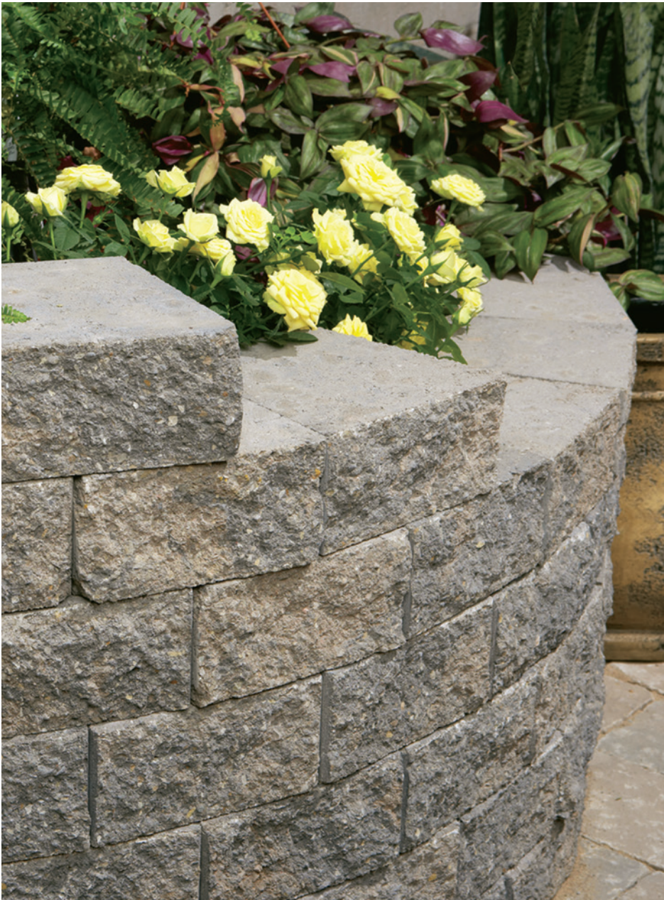
Walls: Modeco One, Chartan