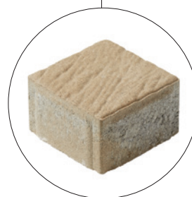
SINGLE-SIZE ACCENT PAVER WITH A UNIQUELY TEXTURED SURFACE

4x4 Stone 4 x 4" (100 x 100mm) Individually Packaged