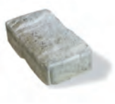
RECTANGLE 5 1/8" x 9" x 2 3/4" 130 x 230 x 70mm