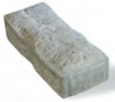
LARGE RECTANGLE 5 1/8" x 12" x 2 3/4" 130 x 305 x 70mm